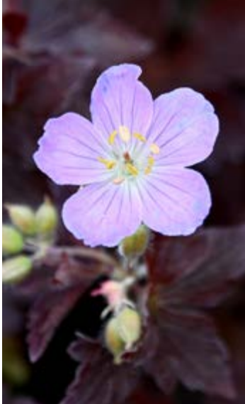
Geranium maculatum 'Huggy Bear'