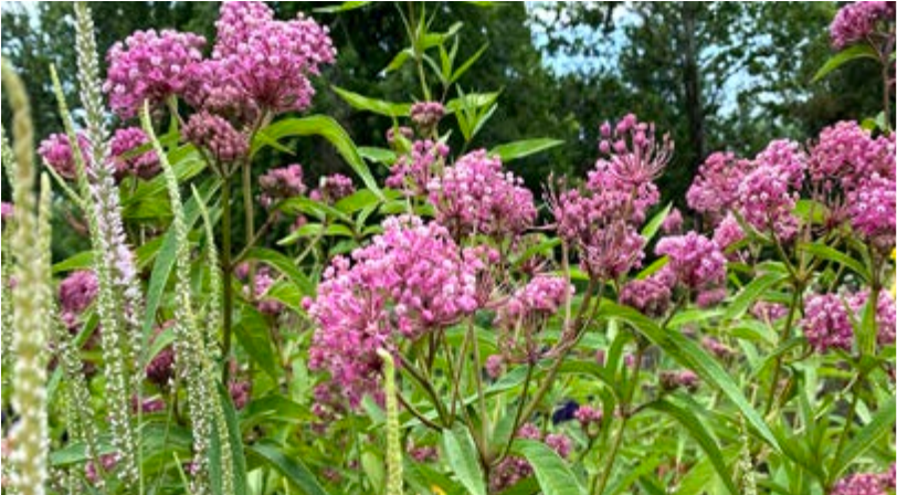
Asclepias incarnata with Veronicastrum Queen of Diamonds