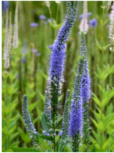
Veronica x 'Seaside' with Veronicastrum 'Queen of Diamonds'