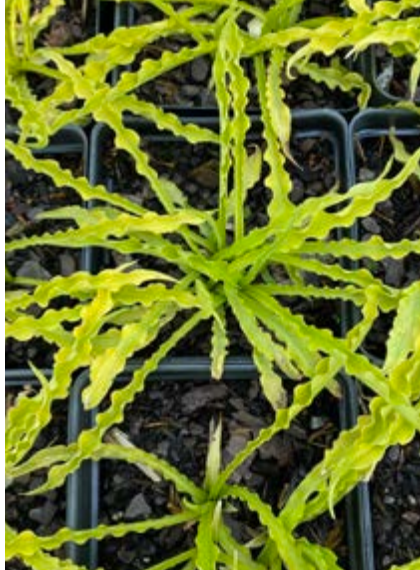
Hosta 'Party Streamers'