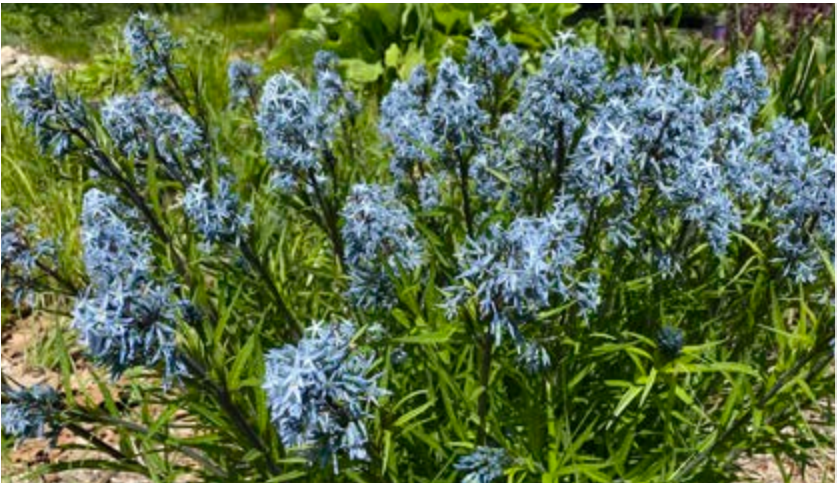
Amsonia x Bases Loaded