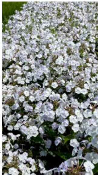
Phlox x 'Early Crystal'