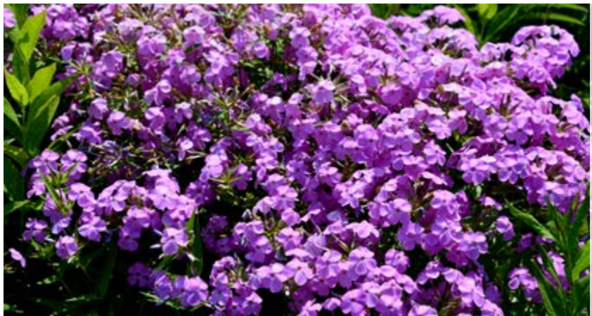
Phlox x 'Pink Pearl'