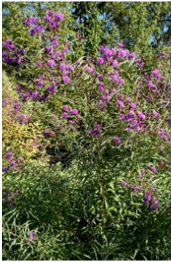
Veronica x 'Over My Head'