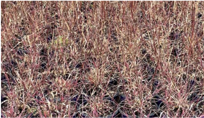
Bouteloua curtipendula 'Sunset Prairie'