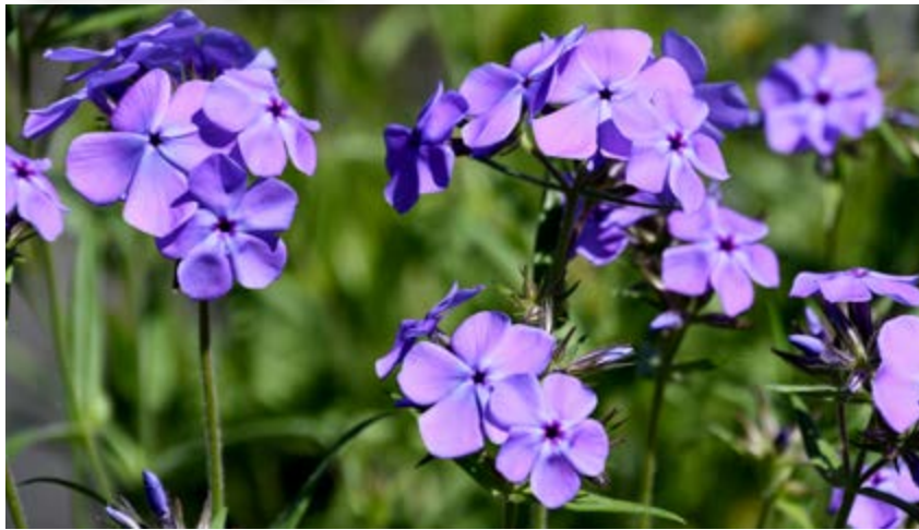
Phlox x 'Mr Blue Sky'