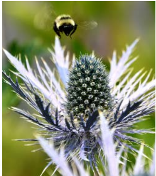
Eryngium 'Miss Wilmotts Ghost'

Amsonia cvs Aster cultivars Baptisia cvs Carex and Ferns Geum Geranium cvs Polygonatum Ver-no-nia CVS